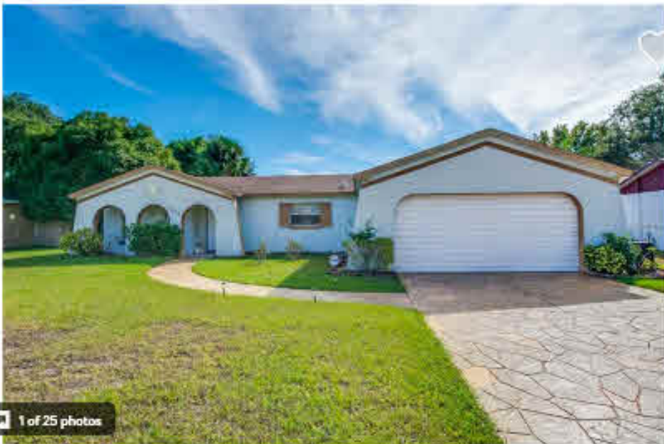
1 of 25 photos