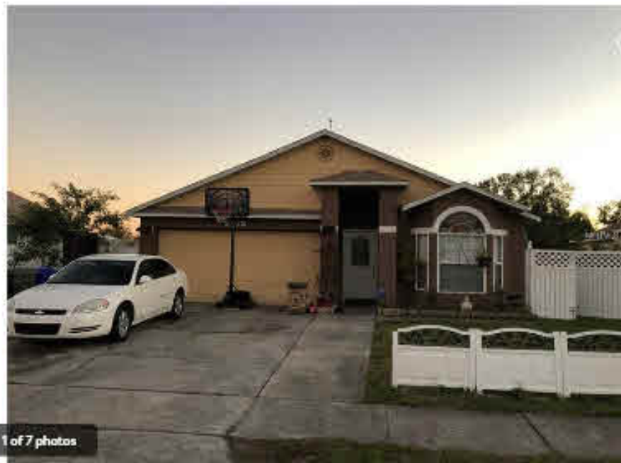
1 of 7 photos